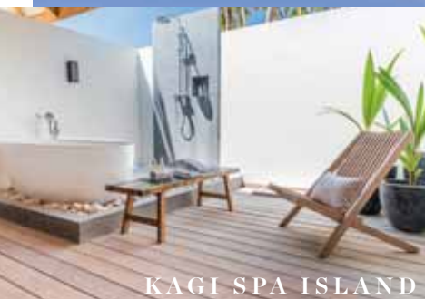
KAGI SPA ISLAND