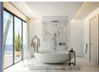
LUX* GRAND BAIÉ

On the wild south-west coast, at the foot of a mountain monolith, serene sister property Lux* Le Morne was reimagined with a bold new look last year too. Rooms at the zero-waste resort have been pared-back to reveal clean neutrals, and come with sun decks and a fully kitted-out tropical bar. The coconut-studded beach, meanwhile, affords views of dolphins frolicking on the horizon. Doubles from £297. luxresorts.com —————>>