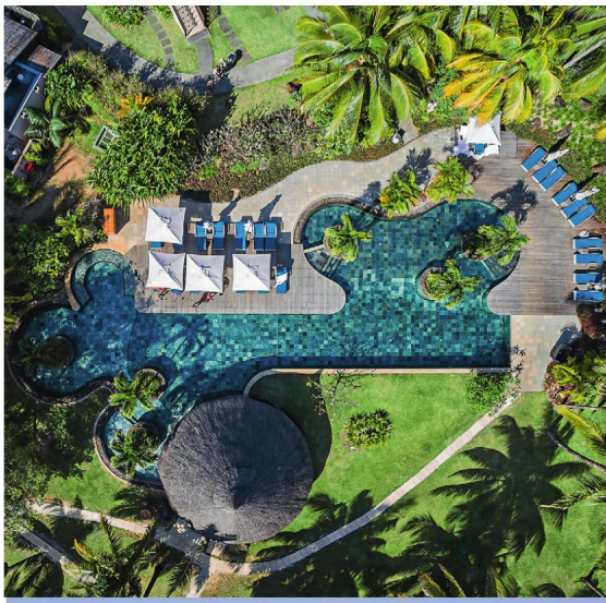
LUX* LE MORNE